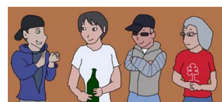
The Official Opening