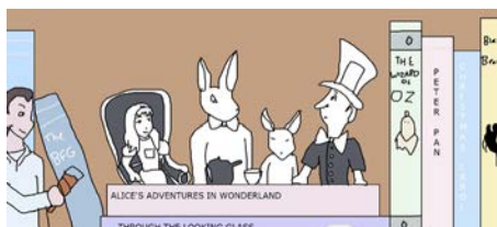
Creative Arts Mural